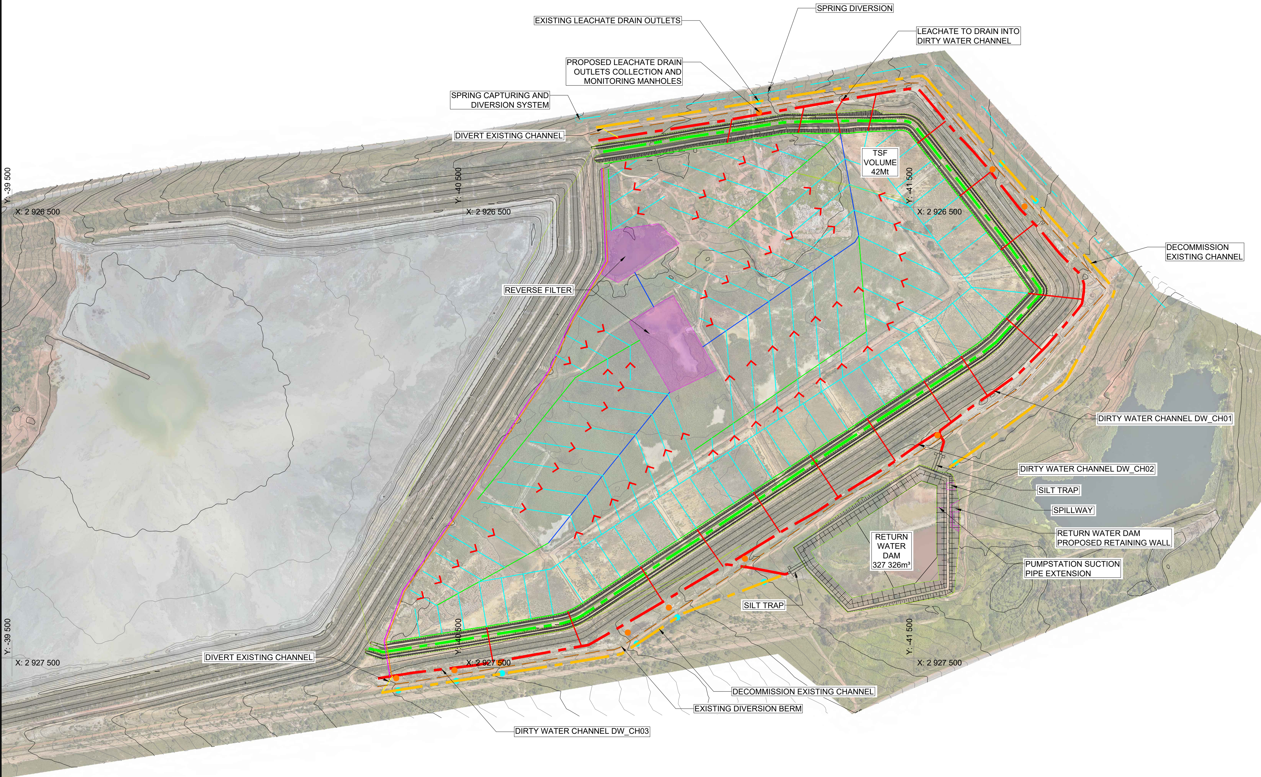
LEACHATE DRAINAGE LAYOUT PLAN SCALE 1:5 000